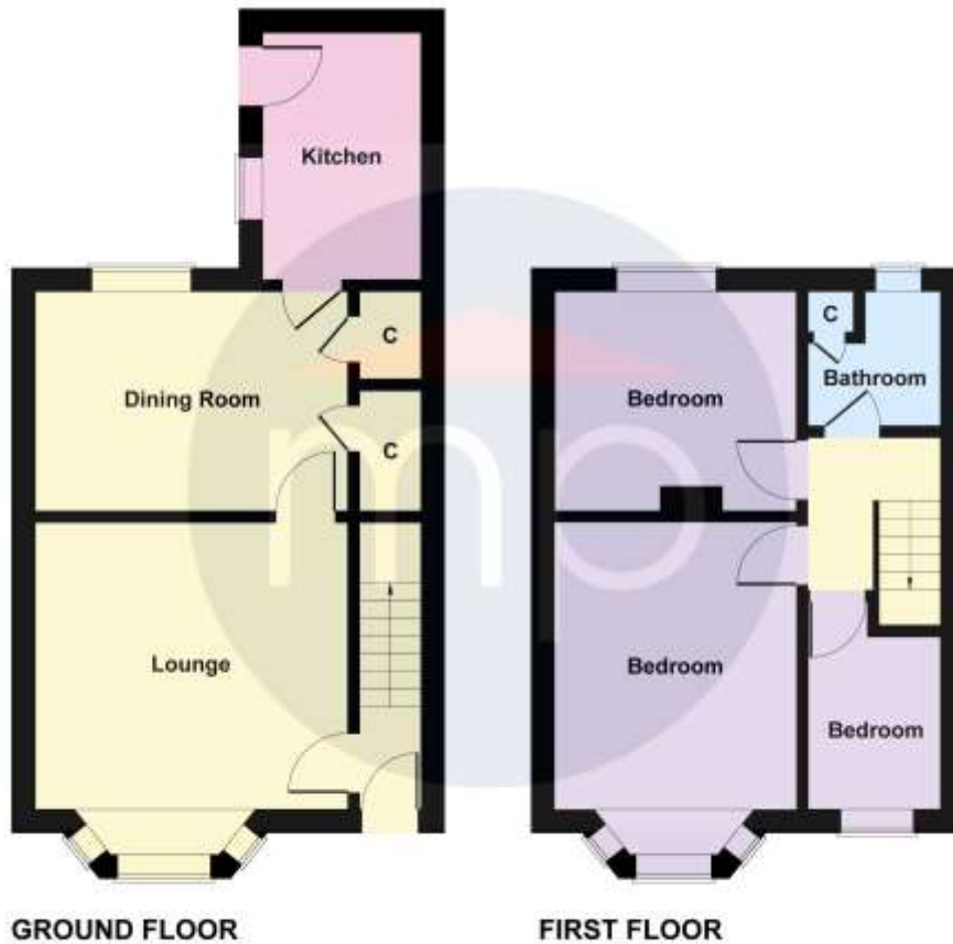
Not to Scale. Produced by The Plan Portal 2024 For Illustrative Purposes Only.

The information provided about this property does not constitute or form part of an offer or contract, nor may it be regarded as representations. All interested parties must verify accuracy and your solicitor must verify tenure and lease information, fixtures and fittings and, where the property has been recently constructed, extended or converted, that planning/building regulation consents are in place. All dimensions are approximate and quoted for guidance only, as are floor plans which are not to scale, and their accuracy cannot be confirmed. Reference to appliances and/or services does not imply that they are necessarily in working order or fit for the purpose. We offer our clients an optional conveyancing service, through panel conveyancing firms, via MWU and we receive on average a referral fee of one hundred and thirty pounds, only on completion of the sale. If you do use this service, the referral fee is included within the amount that you will be quoted by our suppliers. All quotes will also provide details of referral fees payable.